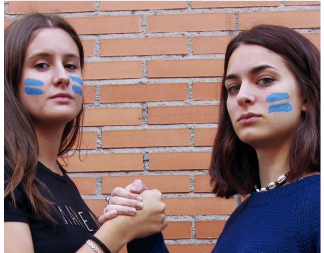
Equality Influencer training for youth with Plan International